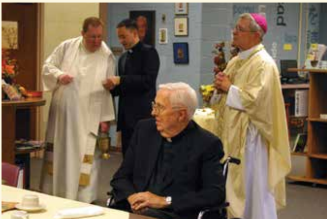
Dedication of the Msgr. Raymond Wahl Library, October 7, 2014