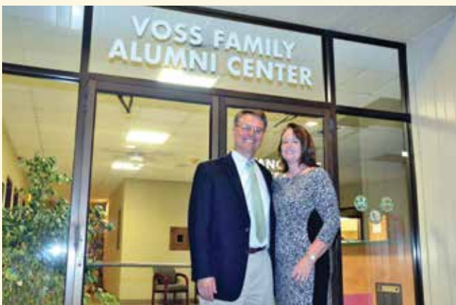
Dedication of the Voss Family Alumni Center, June 20, 2014