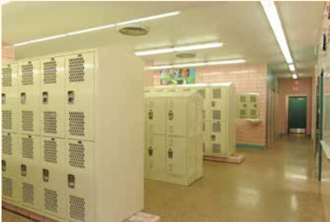
Renovation of the Girls' Locker Room, Summer, 2011