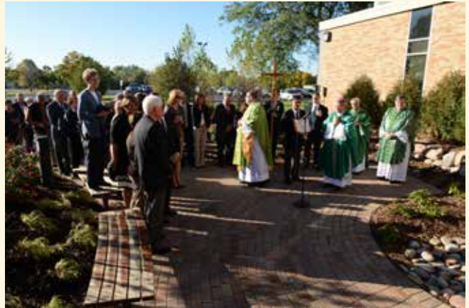
Dedication of Our Lady of Grace Grotto, October 8, 2013